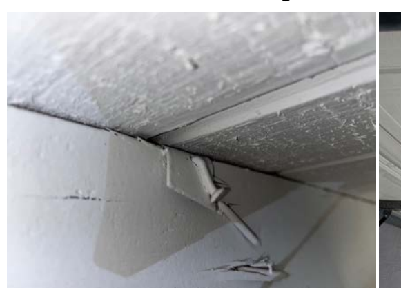
Single Wrap RTW Connection